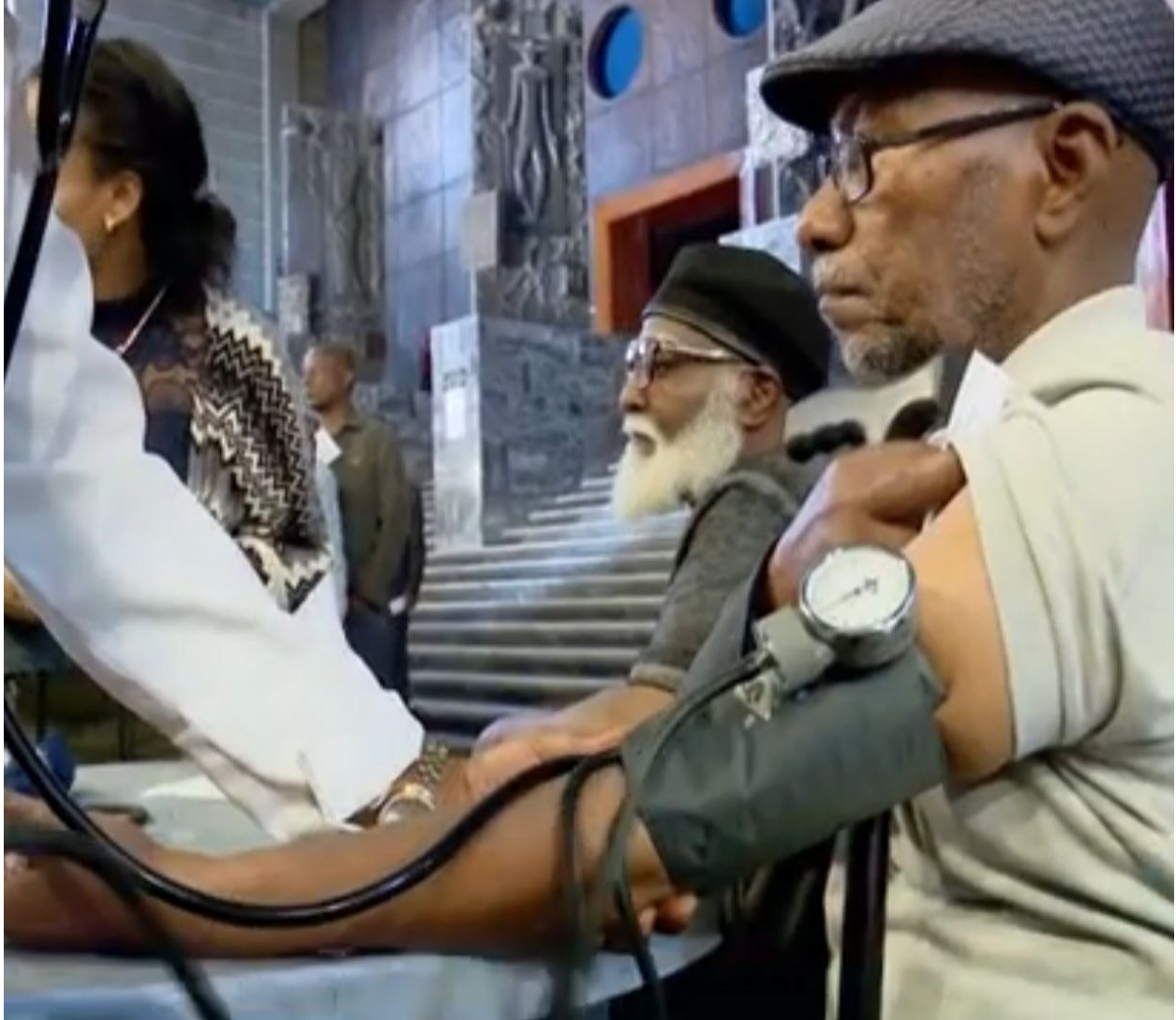
World kidney day on March 13, 2025 at Ethiopia national theater