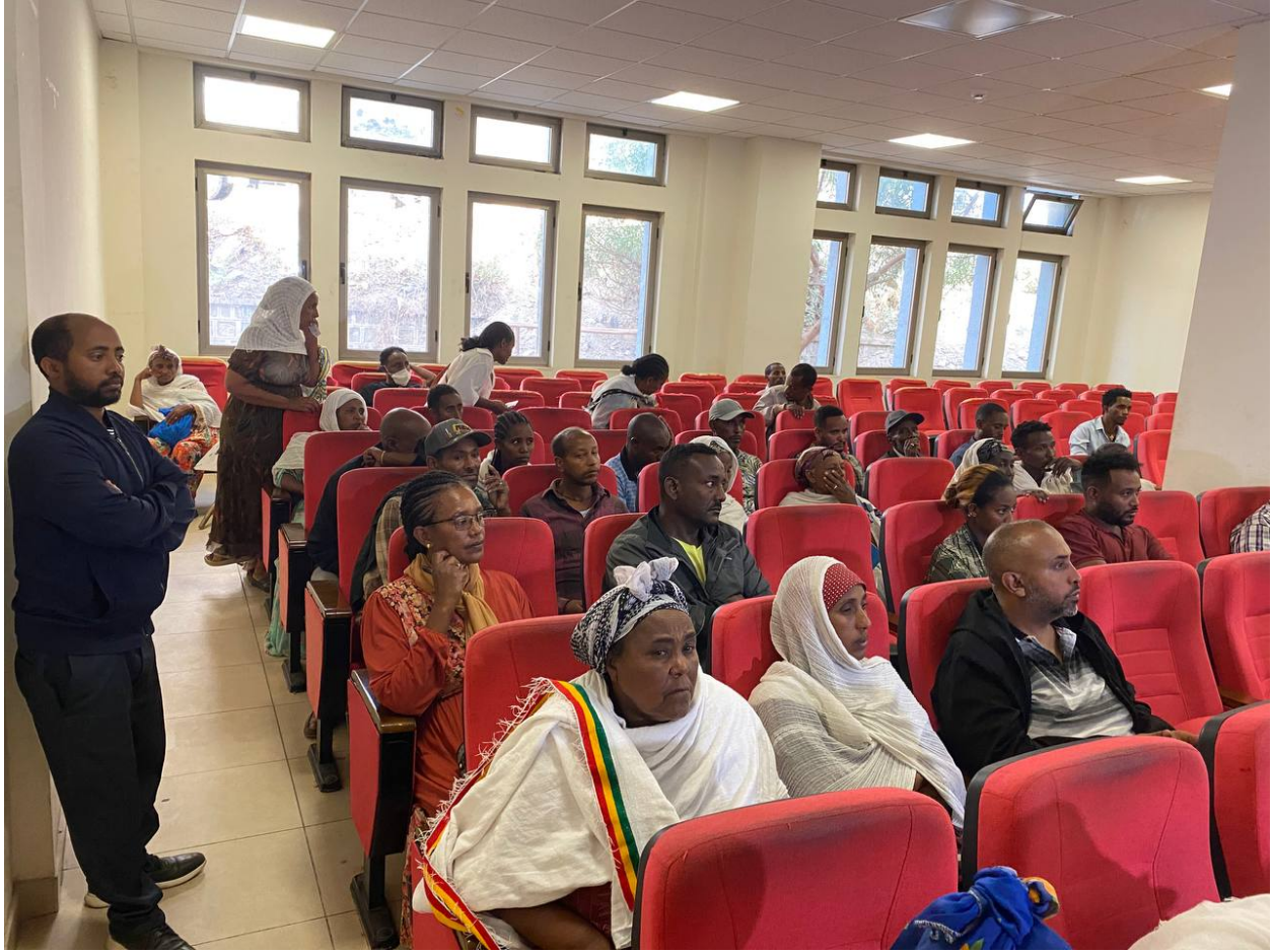
World kidney day screening at university of gondar on march 13, 2025