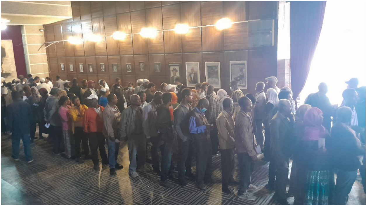
World kidney day screening at national theater on March 13, 2025