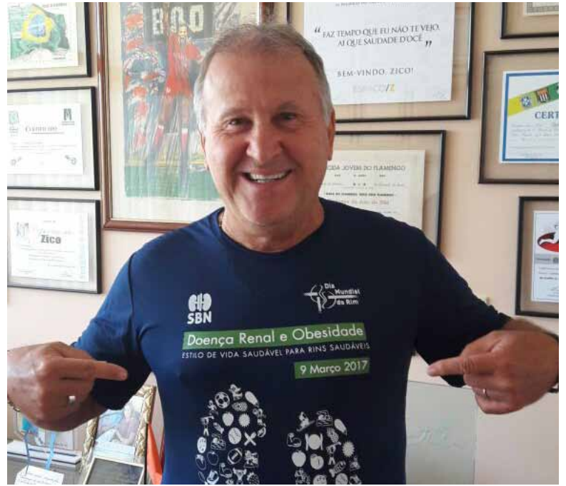
Neymar Jr Zico Tite Poliana Okimoto

Many sport celebrities gave their contribution for WKD, sending to us or publishing their pictures wearing our t-shirt in social media, always mentioning the importance of healthy lifestyle for healthy kidneys.