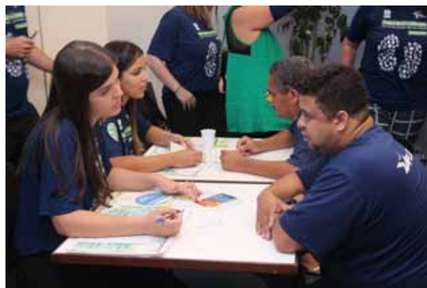
Nutritionists explaining the WKD theme and CKD to Congress workers.