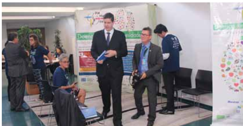
WKD Campaign at Brazilian Congress