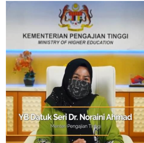
YB Datuk Seri Dr. Noraini Ahmad Menteri Pengajian Tinggi

FORUM ON LIVING TRANSPLANTS: CODE:LIFE- A BIG GIVE- ORGAN DONATION WAS ALSO DONE VIRTUALLY IN CONJUNCTION WITH WKD 2022 LAUNCHING.