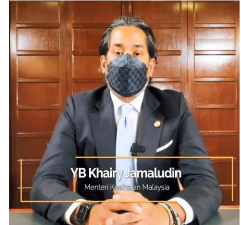
YB Khairy Jamaludin Menteri Kesihatan Malaysia