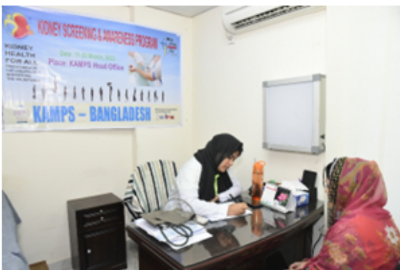
Doctor prescribes medicines to a kidney patient.