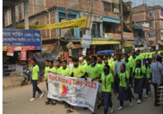
KAMPS Kidney & Dialysis Center - Nawabganj rally to mark World Kidney Day. 2023.