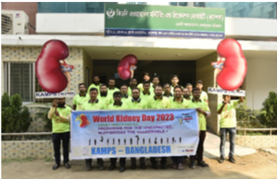
Show Your Kidneys