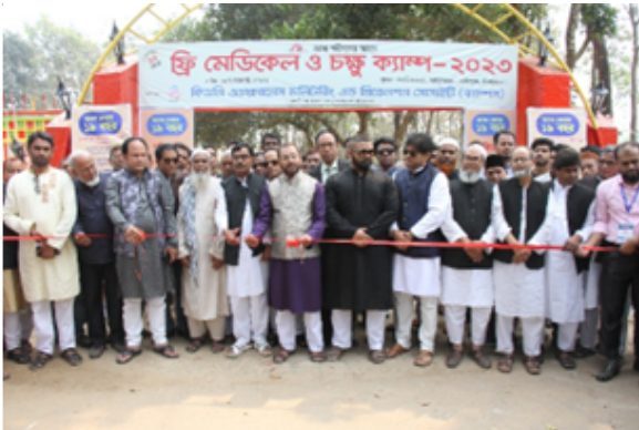
Group Photo of Doctors