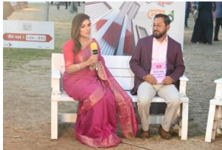
Caption: Cover of the book, and media coverage in LIVE TV Program.

The President of KAMPS, an eminent Nephrologist and researcher has brought out a special publication (Book) named “Kidney Somossa: Somadhan o Protirodh” (Kidney Problem: Solution and Remedial Measures) recently. The formal cover unveiling ceremony of this book was held during the ‘National Book Fair,’ the biggest annual book fair in Bangladesh. The fair is organized every month of February, in honor of the language martyred.