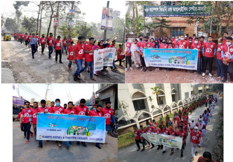
Photo Caption: To mark the World Kidney Day-2022, KAMPS Kidney Center, Tangail, Chandpur, Madaripur and Sakhipur brought out separate colorful rallies in the respective cities.

Details: KAMPS has established four dialysis units in remote parts of the country aiming to provide kidney care services to poor people at a nominal cost and to spread messages of awareness among general people. The dialysis units are in Tangail, Chandpur, Madaripur, and Sakhipur. All the units arranged daylong programs to mark the day. In the morning KAMPS Kidney and Dialysis Center at Tangail, Madaripur, Chandpur and Sakhipur brought out separate rallies in the respective cities. The rallies paraded different busy areas across the district cities.