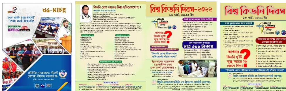
Caption: Health Magazine and flyers.

Health awareness magazine named 'PRAYASH' (Effort), 18 th volume was published and distributed among participants to provide the people knowledge about kidney disease and its prevention. Almost all the news channels aired, and newspapers published the news.