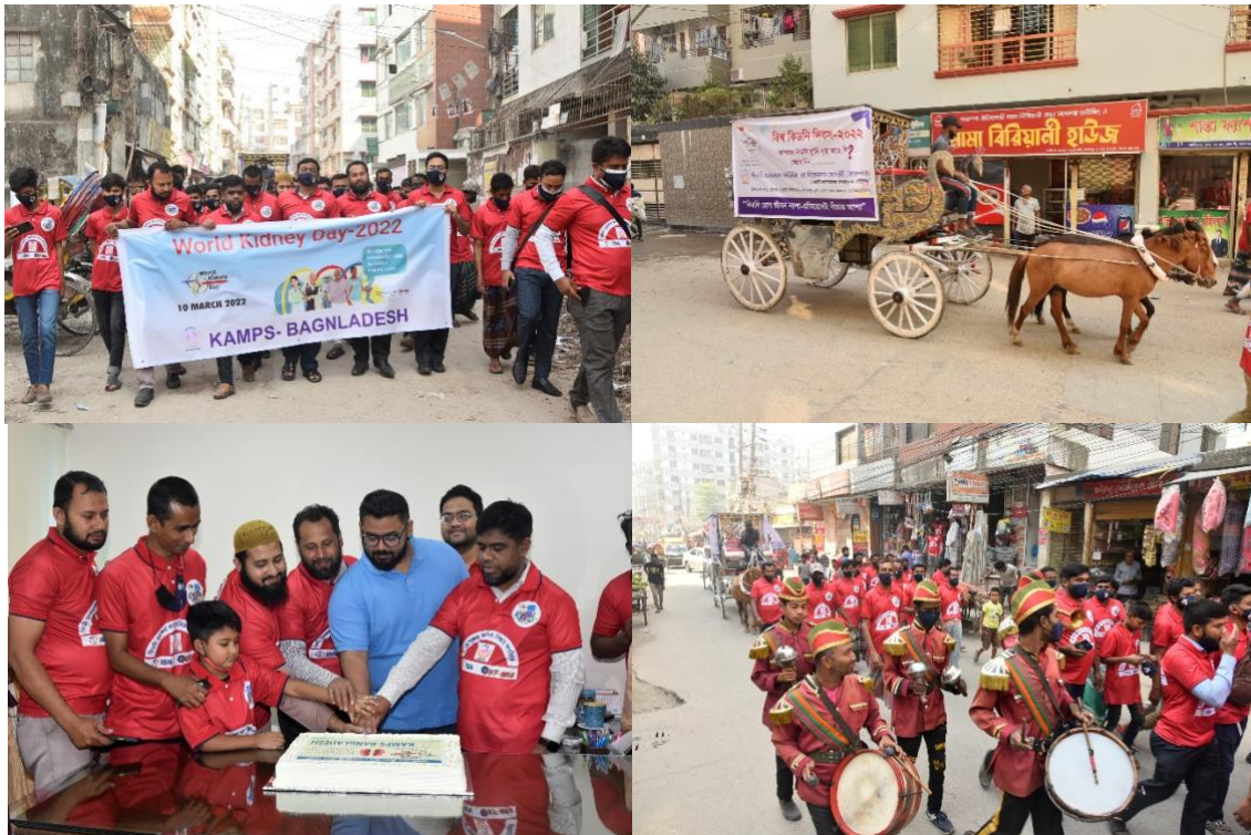
Photo Caption: To mark the World Kidney Day-2022, they brought out colorful rallies at KAMPS Head office at Mohammedpur Nobodudoy R/A, Dhaka.

Details: KAMPS registered head office situated in Mohammedpur, Dhaka, Bangladesh provided kidney care services free of consultancy & low-cost pathological tests. Moreover, to spread the messages of awareness among general people, KAMPS distributed 100k leaflets, 10k posters, Banners, and Festoons in different areas around the head office to mark the day.