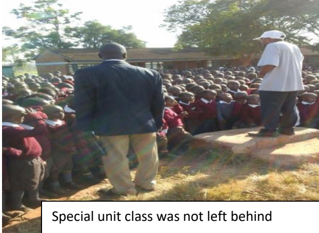
Special unit class was not left behind